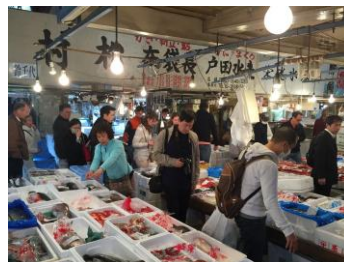
Toyosu fish market