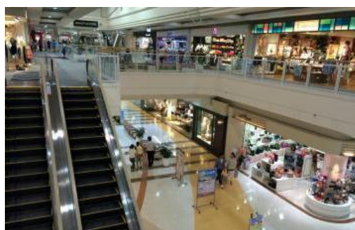
Narita AEON Mall