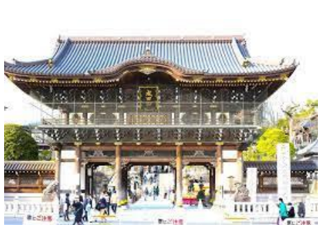
Naritasan Temple Entrance