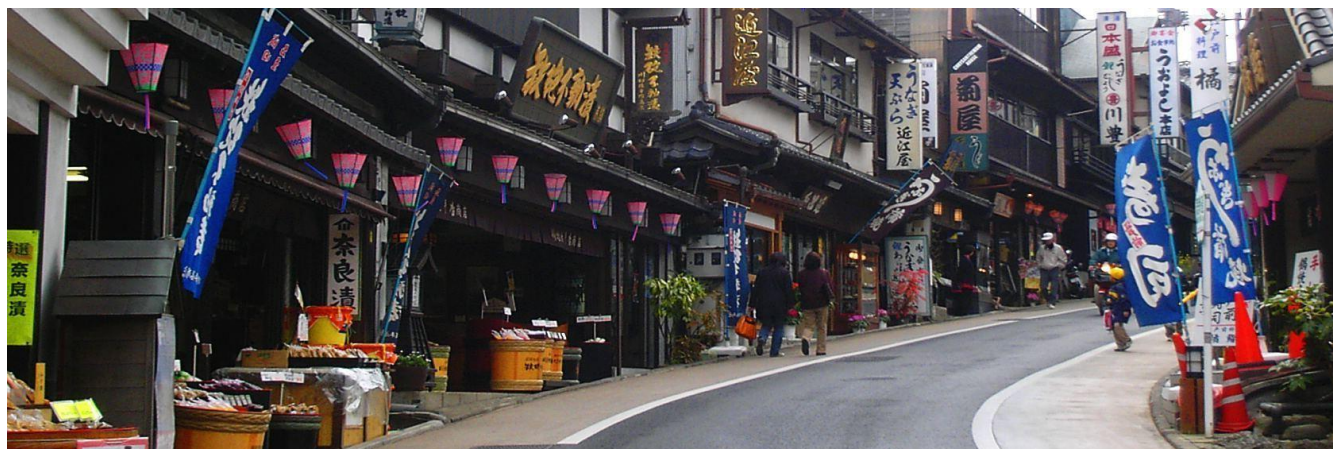
Narita Sando Street